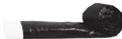
BIS Series - Black Jacket