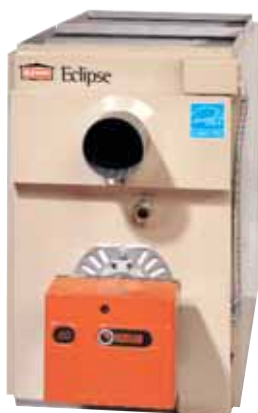
Eclipse HIGH EFFICIENCY OIL-FIRED LOWBOY FURNACE