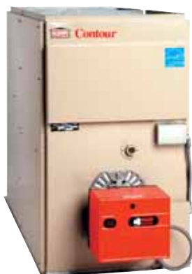
Contour HIGH EFFICIENCY OIL-FIRED LOWBOY FURNACE

Kerr stands behind every product it sells and carries one of the best warranties in the business.